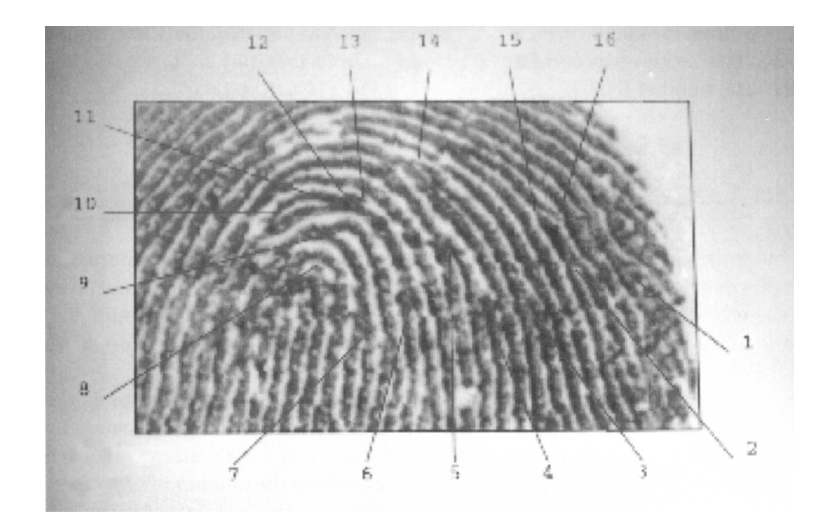
Figure 13.2 Inked print.

However, even when we do have a correct match (with 20, or 24, or however many points), its implications are not entirely obvious. It is possible for fingerprints to be transferred using adhesive tape, or for molds to be made—even without the knowledge of the target—using techniques originally devised for police use. So it is possible that the suspect whose print is found at the crime scene was framed by another criminal (or by the police—most fingerprint fabrication cases involve law enforcement personnel rather than other suspects [110]). Of course, even if the villain wasn't framed, he can always claim that he was and the jury might believe him.